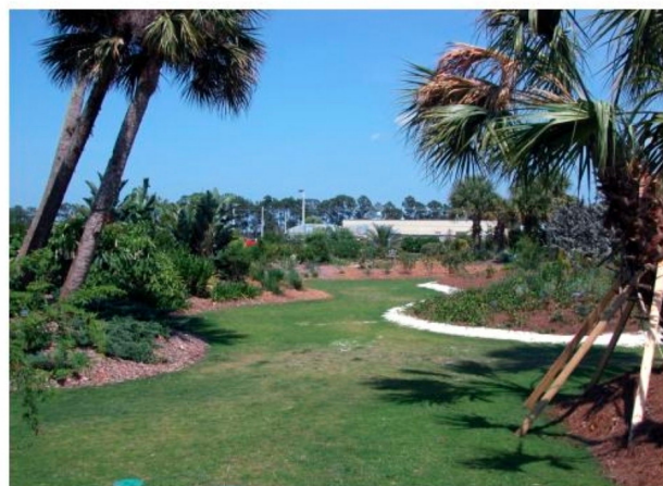
Figure 5. East view of IRREC ornamental teaching gardens, overlooking salt tolerant Florida native plants (right side).

was selected for its wear tolerance and chinch bug resistance (Duncan and Carrow, 2000). Sprigs (300 bushels) were hand spread and embedded into the soil with a straight disk. A roller was attached to the back of the disk to compact the soil around the sprigs.