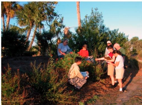
Figure 6. Undergraduate students taking a plant identification quiz for Florida Native Landscaping (ORH 3815C).