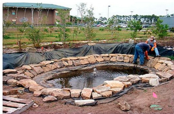
Figure 3. Installation of pond structure in IRREC ornamental teaching gardens.

An 8-zone irrigation system was professionally designed for maximum versatility and appropriate water usage. A 2-inch diameter PVC sub-main line was inserted along the central east/west axis of the garden. Nine 1-inch, full flow, low voltage irrigation