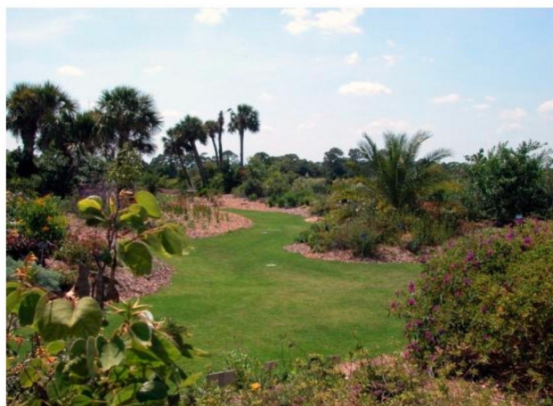
Figure 1. West view of IRREC ornamental teaching gardens, overlooking annual and perennial beds.

other educational centers may find teaching gardens to be a great addition to their current programs and the local community.