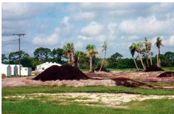
Figure 2. Initial site preparing of IRREC teaching gardens.

A 2-acre fallow piece of land directly west of the IRREC teaching greenhouses (Fort Pierce, FL) was transformed into a teaching garden over the course of 4 years. The north half of the garden was established as a subtropical fruit demonstration block displaying 88 specimens of mango, lychee, avocado, citrus, and other tropical fruit. The south half of the garden was designed as an ornamental display garden. The materials utilized and processes involved in the ornamental garden are outlined in Table 1. Many of the items listed were donated, but the estimated cost is shown to illustrate how costly creating even a small garden can be, when done professionally.